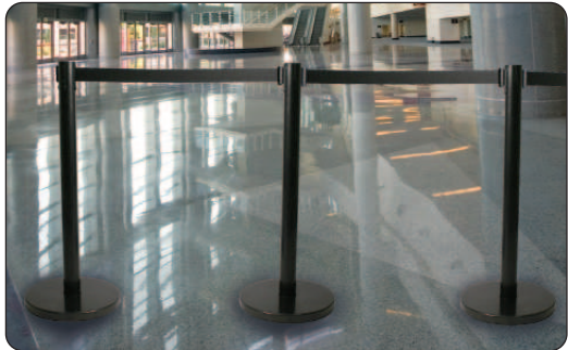
Example of 3 units joined together to form a row