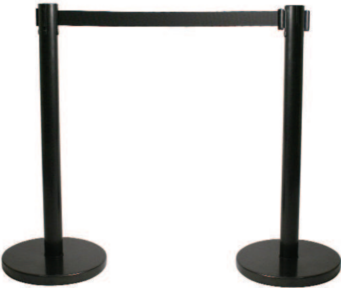
NB: Image shows 2 connected units (supplied as single units)

Leader plus is a smart retractable barrier system, ideal for use in retail outlets, airports, entertainment venues, reception areas or any location where queue control is required.