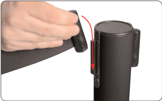
Simply slide the webbing into the fixing and lock into place.