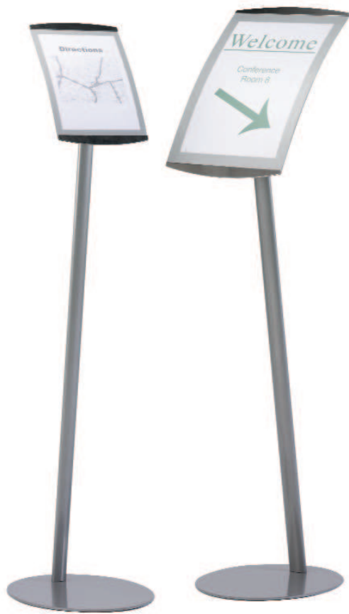
Freestanding A4 CN104

A range of stylish freestanding and desktop poster frames.